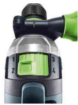
TPC: Optimised gear switching Fast, safe, direct! Switching in any direction – from any gear straight to any other, without intermediate stages. Fixed stops ensure clear engaging. Fast downshifting possible as required.