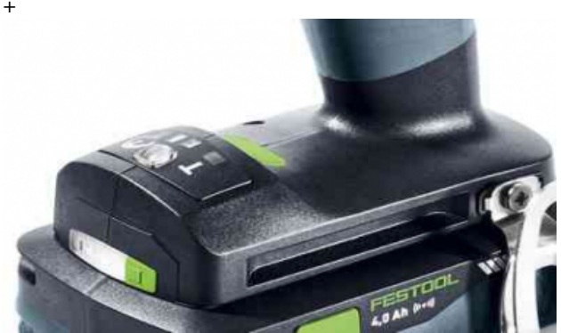
TID: T-mode For controlled work with self-driving screws.

For instantly changing between drilling, countersinking and screwdriving: The CENTROTEC tool chuck, which has proven itself since 2001, is a chuck and bit holder in one. Even though it is half the size and weighs 80% less than a standard chuck: A real Festool invention with the usual Festool quality.