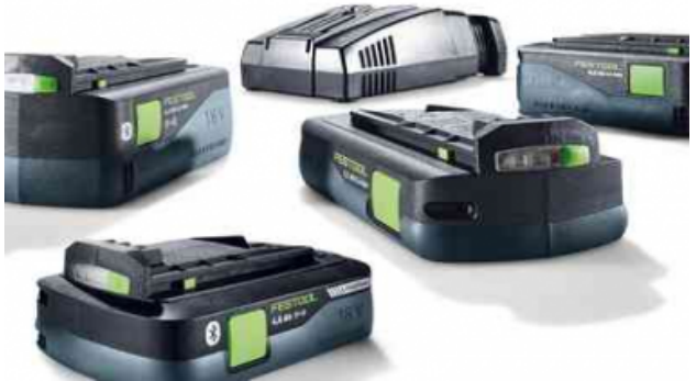
TID: Universal battery system Compatible with Li-HighPower Compact, Compact and Standard batteries, as well as all chargers, for the perfect power-to-weight ratio for every application.