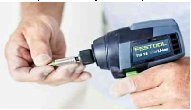
TID: ¼ inch tool holder Quick and easy bit changes.