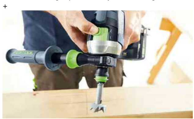
TPC: The QUADRIVE – four gears, with the right one for every application

The electronic KickbackStop prevents your wrist from twisting dangerously if the drill suddenly becomes caught or jammed, therefore ensuring improved safety when working.