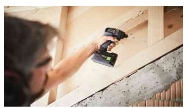
TID: Tangential hammer mechanism No back torque for screwdriving that protects your wrist.

Sales Centre for Sales, Advice + Orders T +61 8 9209 7400 hello@beyondtools.com