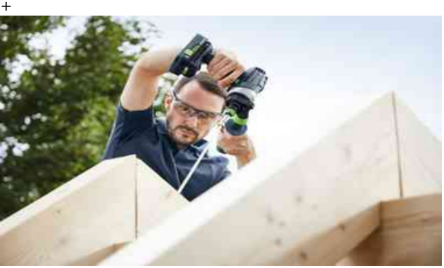
TPC: Increased power in 2nd gear 40% more torque compared to the previous model for full traction with 8 mm screws.