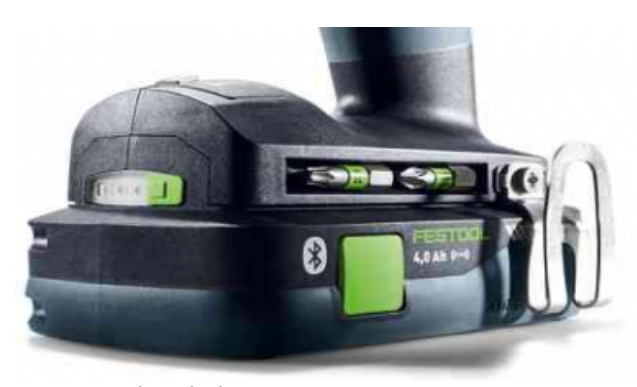
TID: Convenient design Everything is to hand with integrated bit storage, powerful LED and belt clip for attachment on both sides.

Sales Centre for Sales, Advice + Orders T +61 8 9209 7400 hello@beyondtools.com