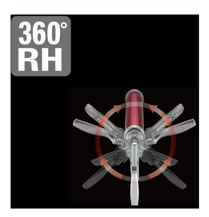
360° Rotating Handle<sup>™</sup> For maneuvering in and around tight spaces.

By increasing 20% of contact surface between plunger and valve plate, the thrust force is transmitted to the plunger without reduction.