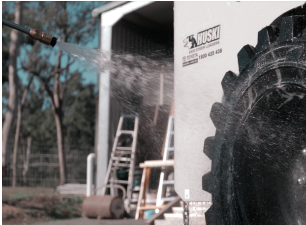
Rapid Soap Detergent Nozzle