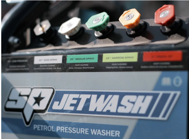
Colour Coded Nozzles