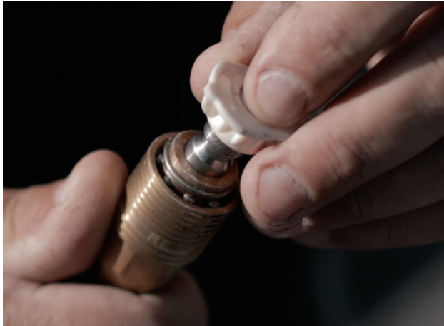
Quick Connect Nozzle Fitting