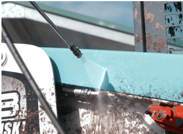
Full Steel Lance